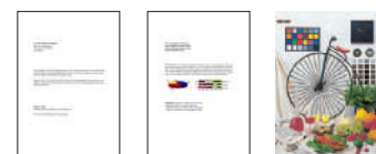
#1 Black Text #2 Black Text and graphics #3 Photo 4R (4 x 6")

*1 Print speed (Pages Per Minute) is calculated when printed on A4 plain paper in the fastest mode, 10 x 15cm photo print speed when printed on Epson Premium Glossy Photo Paper. Print speed may vary depending on system configuration, print mode, document complexity, software, type of paper used and connectivity. Print speed does not include processing time on host computer.